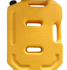
10L fuel tank