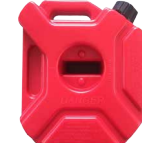
5L fuel tank