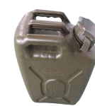
三把手油箱 three handle tank